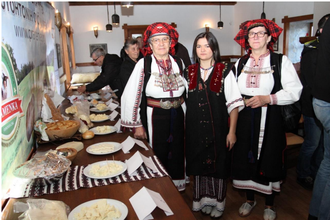
Figure 2. Food exhibition showing traditional products from Bosnia-Herzegovina, including cheese, and ladies using typical costumes