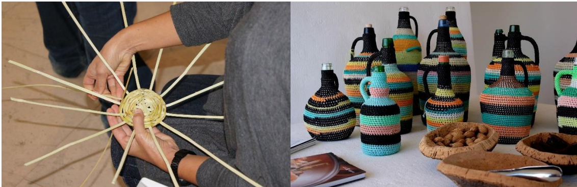
Figure 7. Traditional and contemporary artisanal crafts at Algarve, Portugal.

Under current legislation Cultural Intangible Heritage in Portugal covers the following areas: