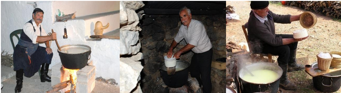
Figure 5. The sequential phases of cheese making in Crete, Greece.

In Crete, the participant region in the MD.net project, several festivals are reported, all related to crops, from carob to bread (e.g. "Efazimo" Bread festival), e.g. Shepherd & Cheese festival, consisting on milking and cheese making presentation (Fig. 5), Thrapsano pottery festival, sardine festival and "Tsikoudia" - Raki Festival (or "Kazanemata"), consisting on the presentation of a typical Cretan spirit drink.