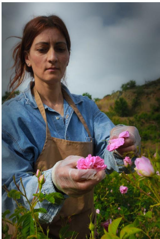
Figure 4. Harvesting Roses at Agros, Cyprus