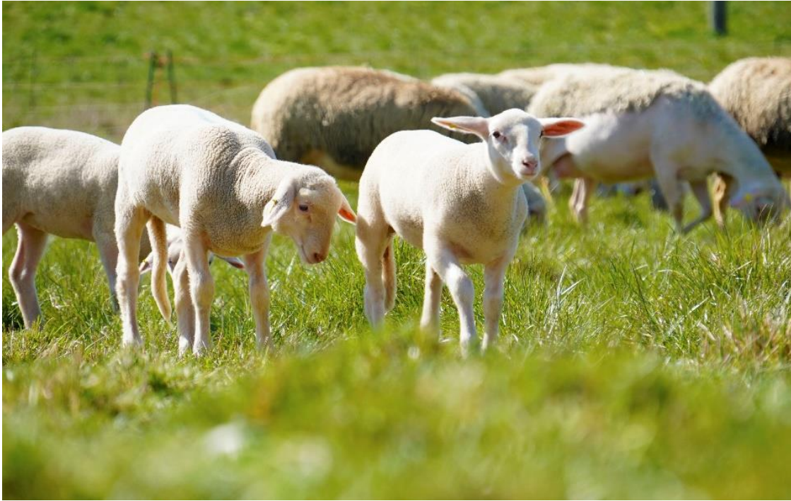
Figure 8. Shepherding in Spain is common to the various regions. In this example the breed is "El Serradet de Barneres", which milk is used to produce a cheese with the same name in Catalonia; source: Prodeca, Catalonia, Spain.

perhaps, the Flamenco is UNESCO's Intangible Heritage, the Easter celebrations "Semana Santa", and Virgen de Rocio Pilgrimage.