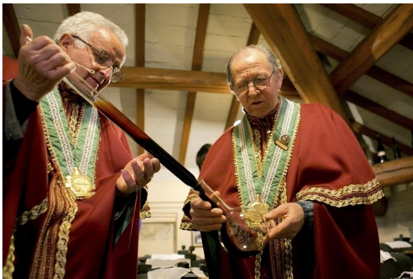
Figure 6. Assessing and tasting balsamic vinegar in Emilia Romagna region, Italy.

Emilia-Romagna region reports the production of fruit and vegetables, meat and seafood and dairy, notably Parmigiano Reggiano DOP cheese. The GUSTI.A.MO18 is a 3-day event dedicated to excellent tastes from Modena: Traditional Balsamic Vinegar from Modena PDO (Fig. 6). Parmigiano-Reggiano PDO, Prosciutto from Modena PDO and Modena Lambrusco PDO wines.